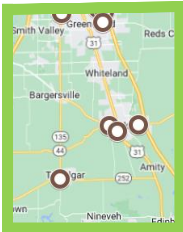
Substance Misuse Resources